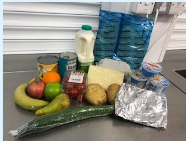
Pictured above - parcel for a family for one child