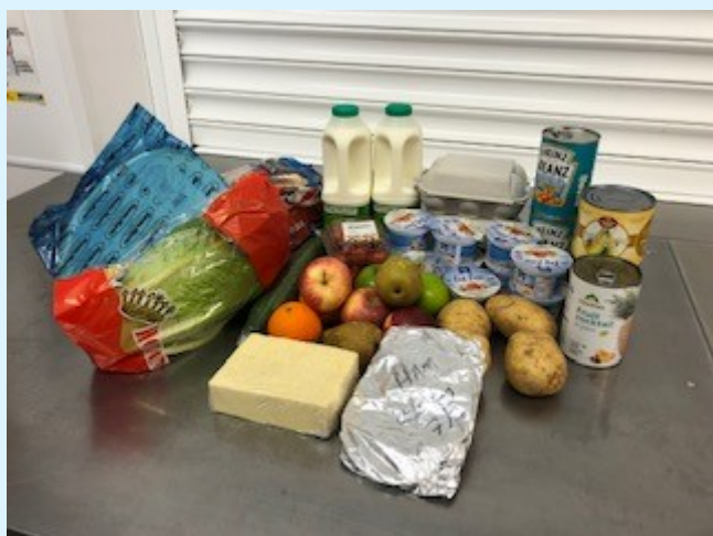
Pictured above - parcel for a family of two children

Click the link for suggestions on how to make nutritious meals with the free school meals parcels: How to make delicious and nutritious meals with free school meal parcels - Plymouth Live (plymouthherald.co.uk)